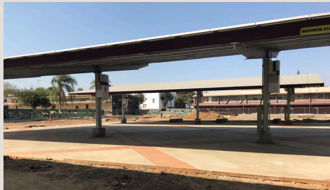
Exterior Concrete Paving