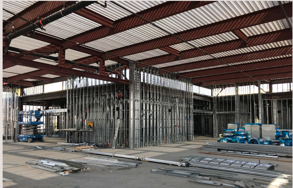
Interior Metal Stud Framing